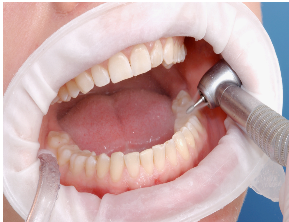
Fig 1: Optragate